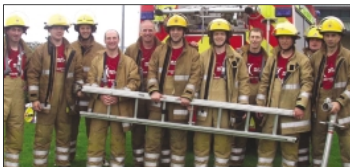
District staff and 9 members of Kirkwall Fire Station

District staff and 9 members of Kirkwall Fire Station took part in the Cancer Research UK Relay for Life held at the Pickaquoy Sports Center on Saturday, 19 August from 8pm till 8am the following morning.