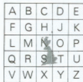
(a) 500 kilometre squares of the National Grid

The full grid reference comprises two letters (identifying the square) followed by six numbers (identifying a place or object). The letters are to be found in the four corners of the map in use. In the Highlands and Islands, the first letter will always be N as this is the 500 kilometre square we live in. The second letter varies across the region.